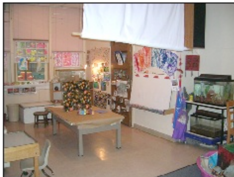
Fig. 2: A Reggio Emilia-inspired preschool atelier

Their creativity skills and discoveries are guided with their inquiries and questions, which become the seeds of long term projects. As Kirkwood [9] states, teachers focus on “what’s in children’s heads” and let children pursue their own questions. From the current study, the following list displays some questions from the project “Insects and Worms”, asked by Reggio kids aged from 3 to 5: