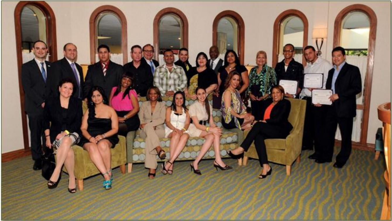
KU's Latino Business Resource Center and Small Business Development Center celebrated the graduation of 24 entrepreneurs from their eight-week bilingual program entitled "Business Skills for Success for Latino Entrepreneurs" May 10, 2012

The purpose of the Kutztown University Latino Business Resource Center is to utilize the Spanish language to better facilitate the learning process of bilingual Latino entrepreneurs. Delivering business development content in a recognizable format and language that bridges the gap between the demands of the fastest growing business and workforce segment in the Commonwealth with the supply of tools and resources offered by economic development organizations. Allowing the Center to more effectively fulfill its overall mission of growing the economy of Pennsylvania by providing entrepreneurs with the education, information and tools necessary to build successful