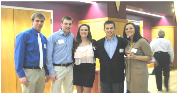
Senior College of Business Students and Business Representatives