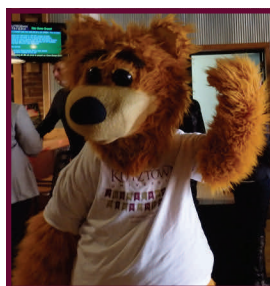
Appearance by Avalanche!!