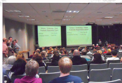
Students, faculty, and prospective students gathered in the Boehm Science Building on Saturday, April 15, 2013, for the biannual Science, Technology, and Math Open House . Students and their families were given the opportunity to learn more about the CLAS departments while interacting with professors and current students.