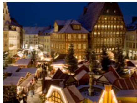
The Christmas Market in Hildesheim