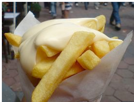
French Fries with Mayo