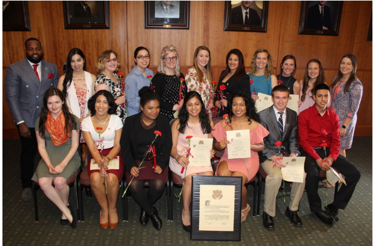
above: inductees, current officers, and former officers of Sigma Delta Pi

Spanish majors and minors were inducted into the KU chapter of Sigma Delta Pi, National Hispanic Honor