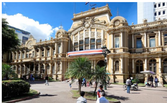
left: Telfes, Austria above: San José, Costa Rica below: Valladolid, Spain