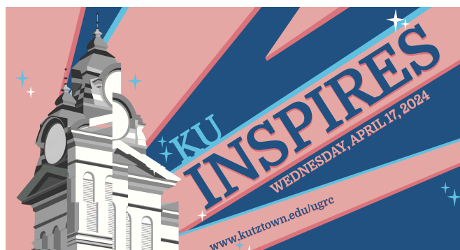
Poster design: Jake Geiger